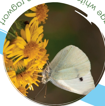
Delicate cabbage white butterfly on ragwort

Did you spot anything else, maybe even those MAMMALS on the cycle route?