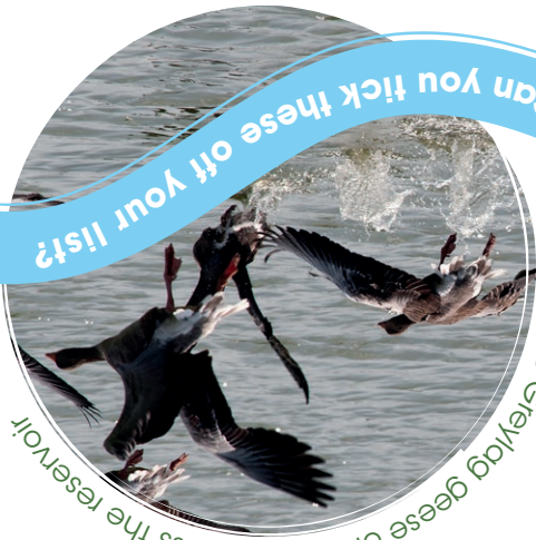
Can you tick these off your list? Energetic Greylag geese on a trip across the reservoir