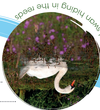
Graceful swan hiding in the reeds